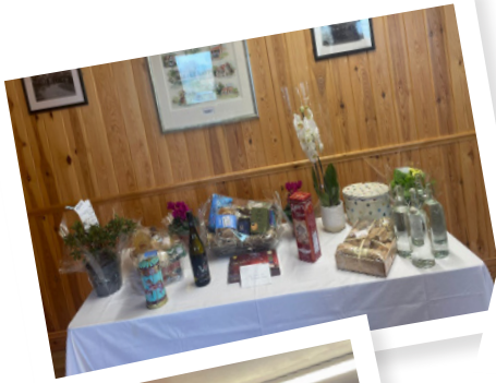
Afternoon Bridge Tea February 2023