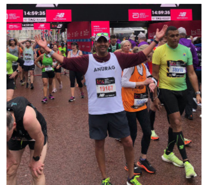
Anurag Virginia, USA